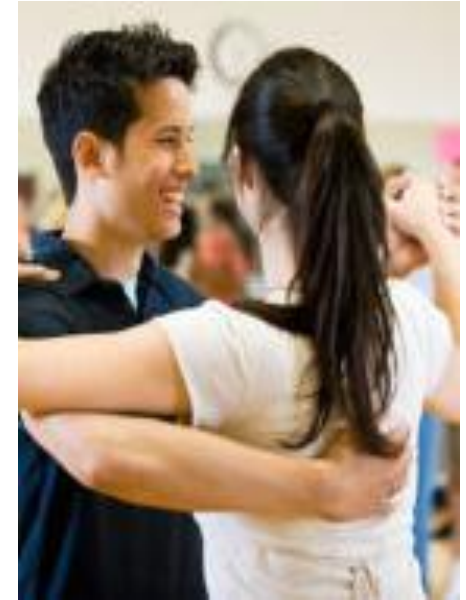
Ballroom, Latin, Swing, Nightclub & Country Dance Classes --& Parties.